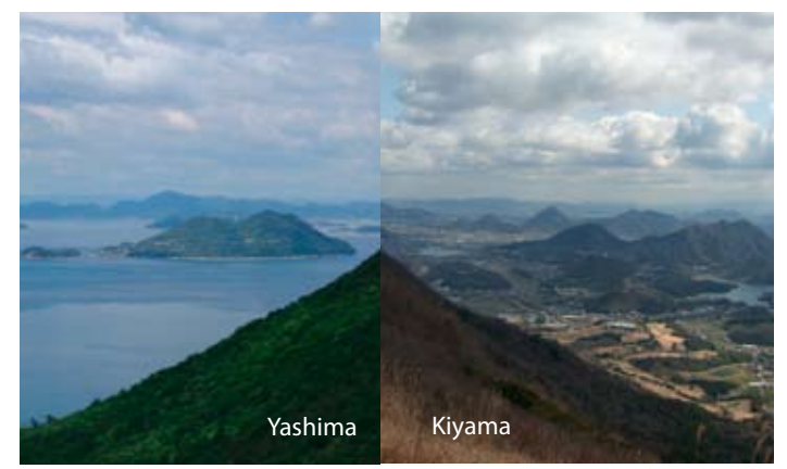
Inland scenery of Kagawa Pref. reminds us Archipelago. Seto Inland Sea is believed to have been a grassy plain in the ice age.