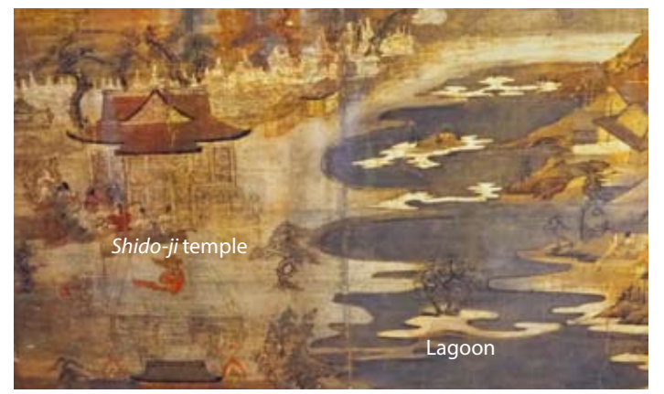
Shido-ji temple was built on a sandbank forming a lagoon. Some legends tell that it is the entrance to the otherworld.